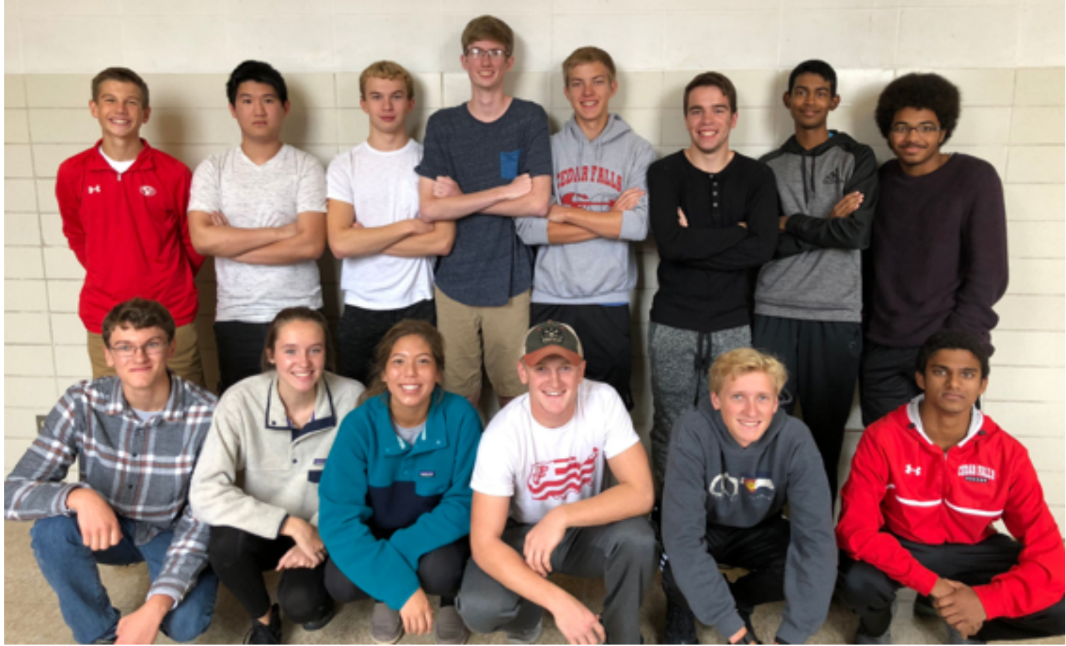
Cedar Falls HighSchool Rocket Club members